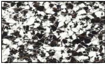
Salt & Pepper