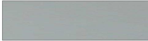
Cape Cod Grey

USE STANDARD COLOR WITH CORRESPONDING PAINT CHIP BLEND